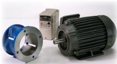
Motors, Motor Adapters, VFDs