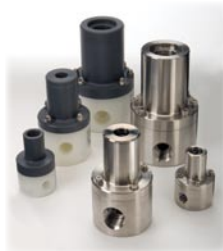
Pressure Relief and Back Pressure Valves